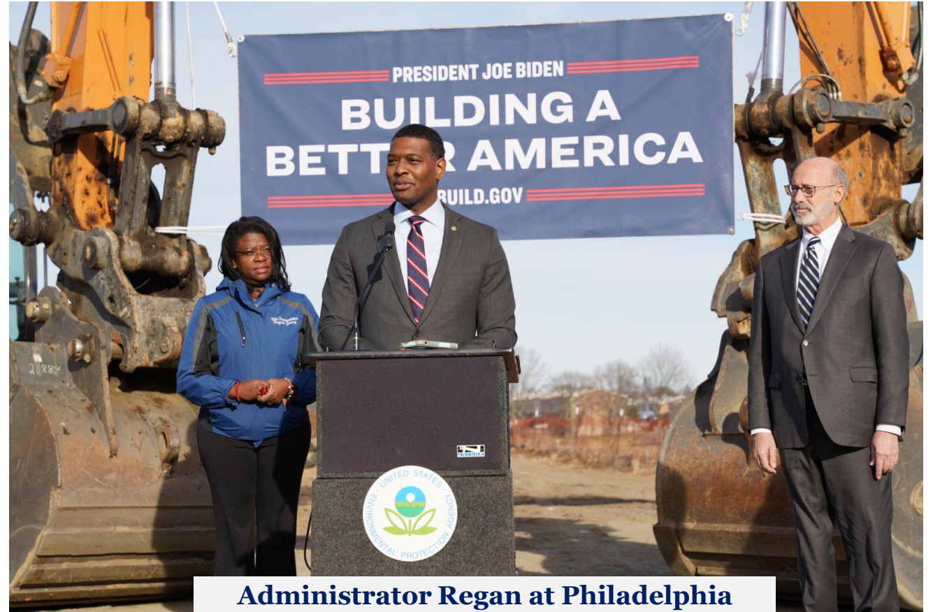
Administrator Regan at Philadelphia Superfund Announcement – Dec 2021