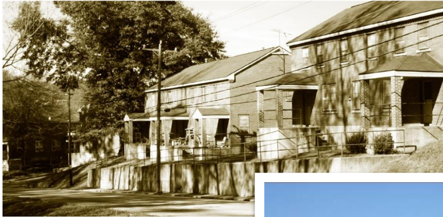
FORMER PHYLLIS GOINS