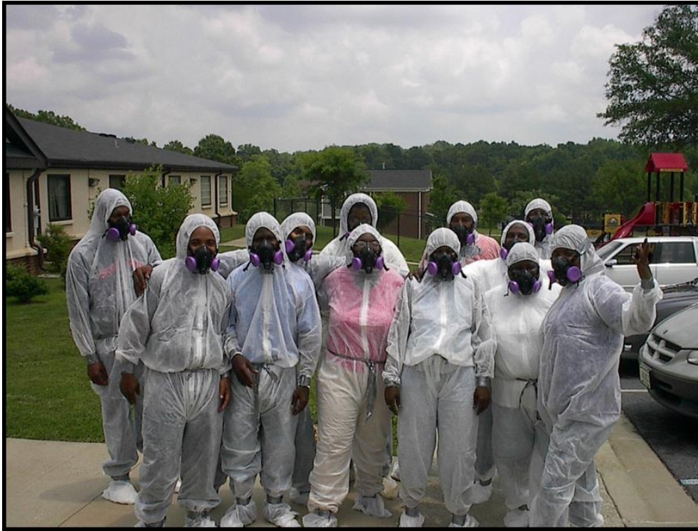
Asbestos Abatement Training 2004