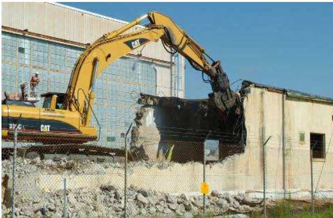
4,500 facilities to decontaminate and demolish