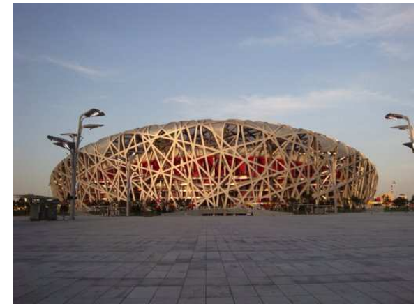
Enough nuclear waste to fill the Beijing National Olympic Stadium