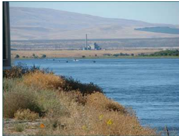
More than 10,000 groundwater and soil sites to protect and clean up